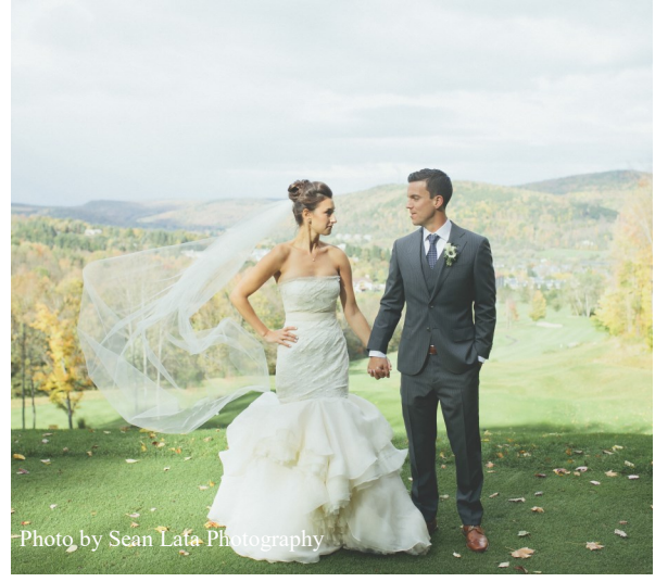
Ellicottville, New York