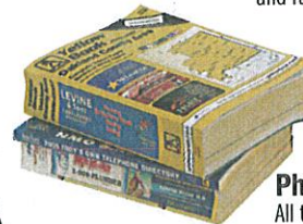
Phone Books All types and sizes