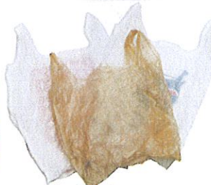
Plastic Bags* Most retail & grocery bags