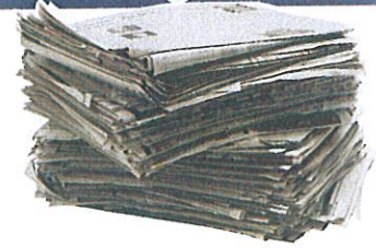
Newspaper Remove bags, strings and rubber bands