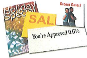
Junk Mail Envelopes, Flyers, Brochures, Postcards, etc.