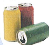
Aluminum Cans* Empty cans only