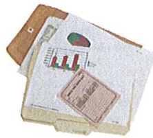
Office Paper All types and sizes