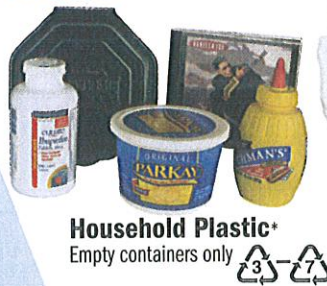
Household Plastic* Empty containers only