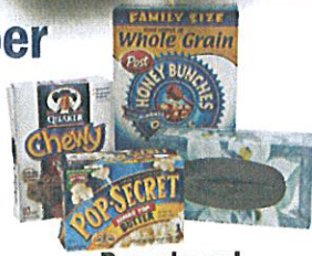
Paperboard No wax coated paperboard