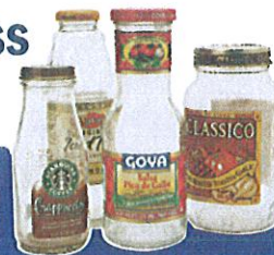
Glass* Clear & colored

Recycle Bin Full? Clear plastic bags can be used for additional items