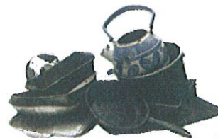
Kitchen Cookware Metal pots, pans, tins & utensils