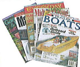
Magazines & Catalogs All types and sizes