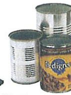
Steel & Tin Cans* Empty cans only